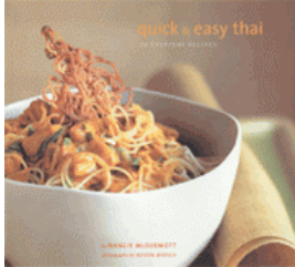
QUICK & EASY THAI